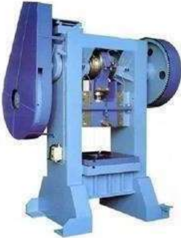
power press machine