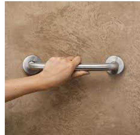
Different types of Hand Rest