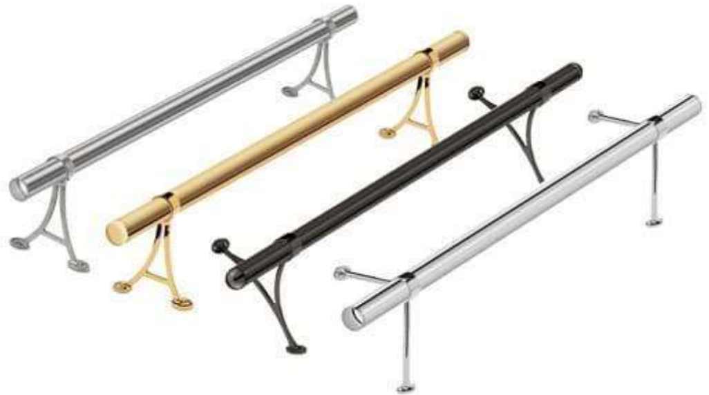
Different types of Bar Railing