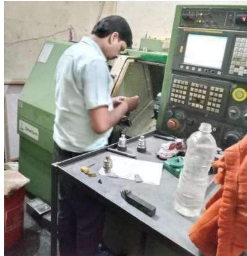
CNC Machine (LMW)